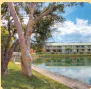
The Moorings (1174) Tomakin