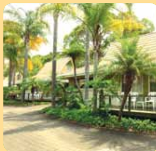
The Holiday Club @ Village Resort (7676) Port Macquarie