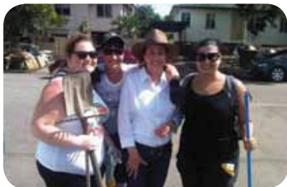
QLD Premier Anna Bligh with RCI Reservation Consultants volunteering in the Brisbane flood clean-up