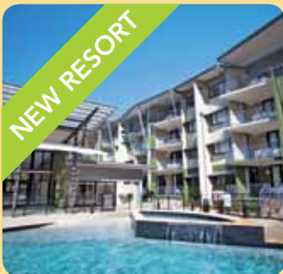
Wyndham Coffs Harbour - Treetops (C012) Coffs Harbour

Check out these great coastal resorts in New South Wales