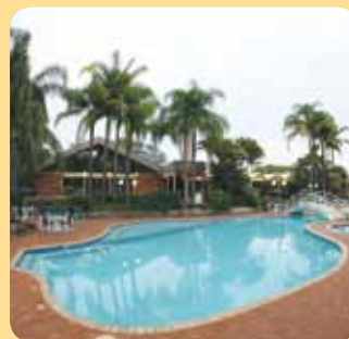
Boambee Bay Resort (1803) Coffs Harbour