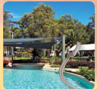
Wyndham Flynn's Beach (7822) Port Macquarie