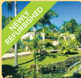
Korora Bay Village (0834) Coffs Harbour