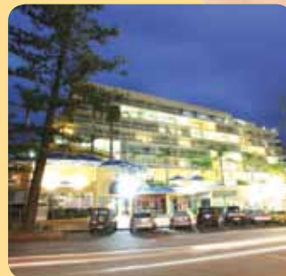
Port Pacific Resort (1816) Port Macquarie