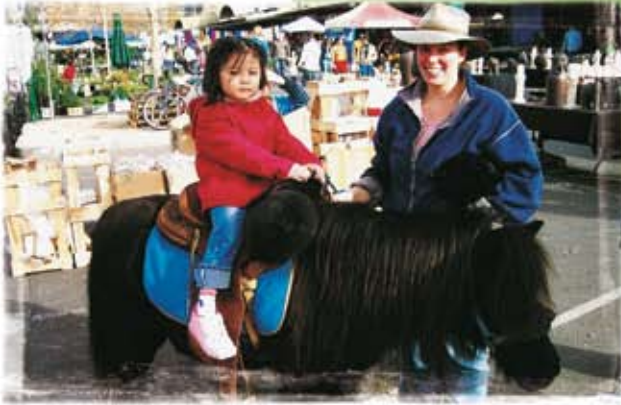
Getting ready for a pony ride at Queen Victoria Market in Melbourne.