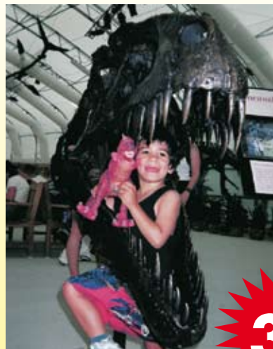
Little boy's dream come true between the teeth of a giant Trex in Orlando's Disney World.