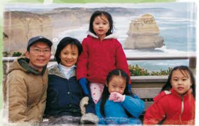
Enjoying the magnificent view of The Twelve Apostles along the Great Ocean Road in Melbourne with my family.