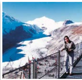
Top: Breathtaking mountain scenery from Mondri Holiday's grounds Left: At Pasterze Glacier off Grossglockner Alpine Road

The next day, with some helpful tips from the resort staff, we drove to Grossglockner High Alpine Road which is regarded as one of the world's most beautiful mountain routes. It was