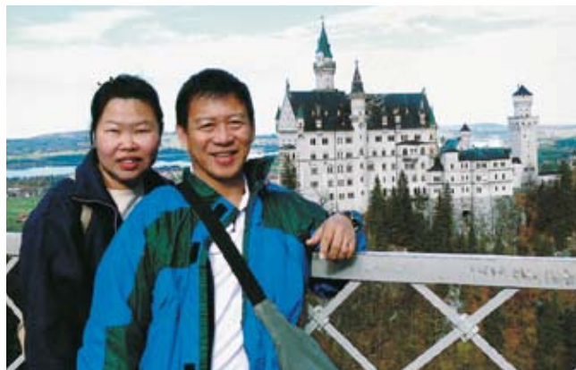
Neuschwanstein Castle in the background

Thanks to RCI, my wife and I had a memorable holiday that we exchanged into. The resorts are superb. We hope to enjoy many more exchange holidays with RCI.