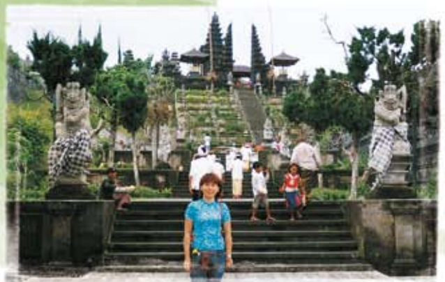
Outside Pura Besakih Temple in Bali, Indonesia.

Personal information collected on this form is consistent with the RCI Privacy Policy.