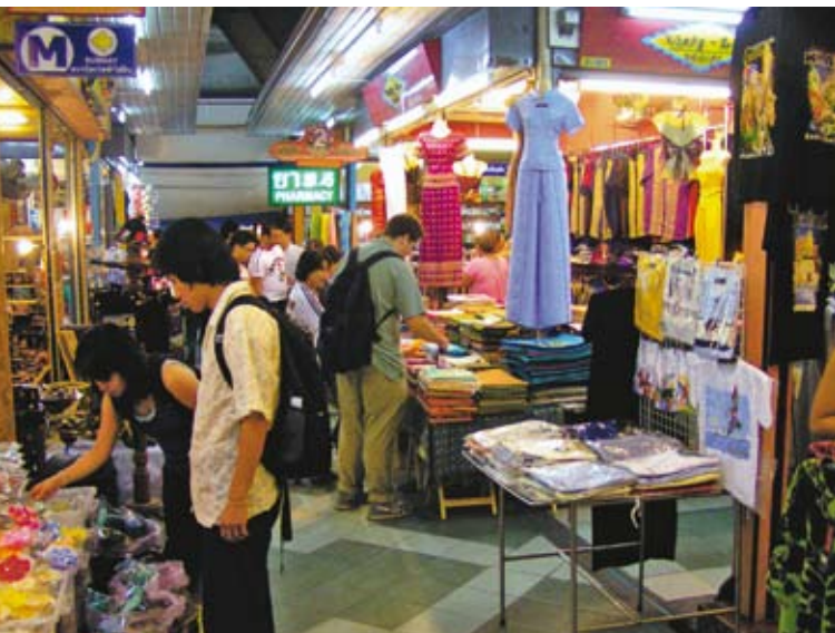
Suan Lum Night Market is a good place both to shop and hang out.

and Japanese and Italian cuisines are de rigueur right now. It is essential to be discerning when it comes to dining in Bangkok as almost all the restaurants here are top-notch.