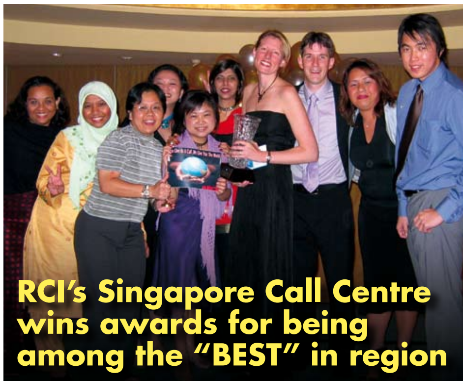
RCI's representative team soaking up a proud moment!