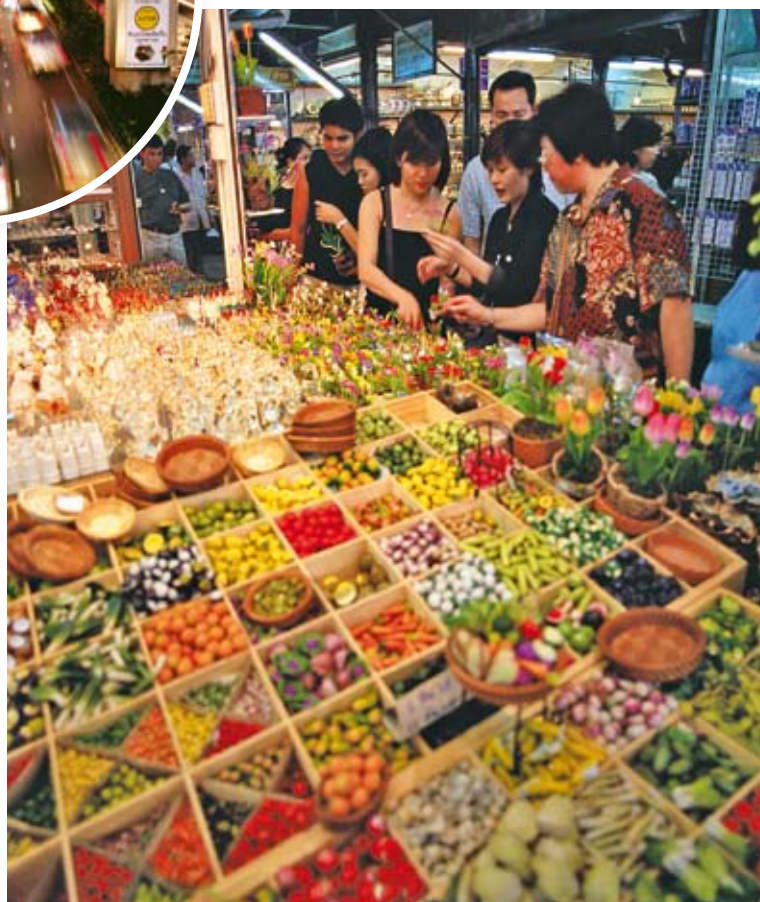
Bargaining is vital at Chatuchak Weekend Market.

Bangkok's wining and dining scene is also burgeoning, with literally thousands of food establishments to choose from,