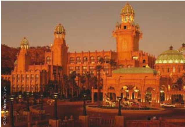
Lost City at Sun City

Treasures unearthed here include a gold rhinoceros and gold bowl.