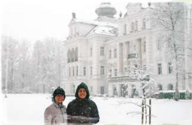
A most memorable early white Christmas at Schloss Grubhof in Salzburg, Austria.